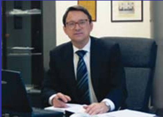
Krzysztof Sikorski Research